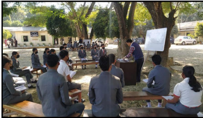
Outdoor Classroom Project